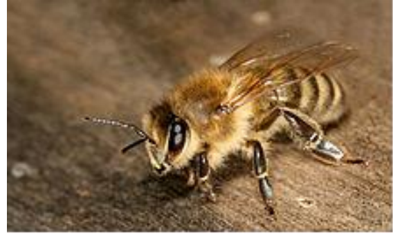
Fig 7. Honey bees ( Apis Mellifica ) [7]