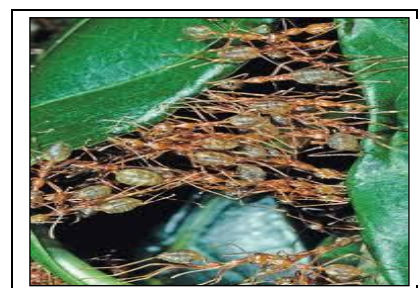
Fig 5. Weaver Ants (Oecophylla) [5]