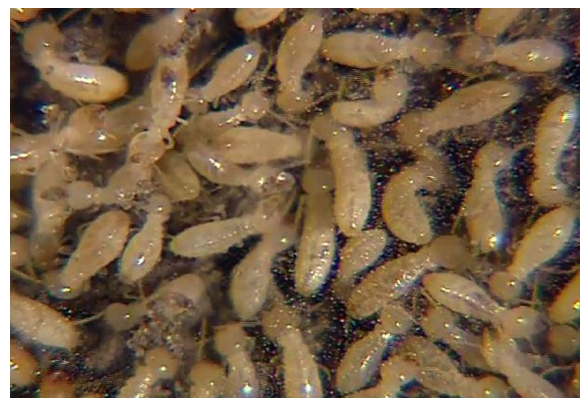
Fig 10. Termite[10]