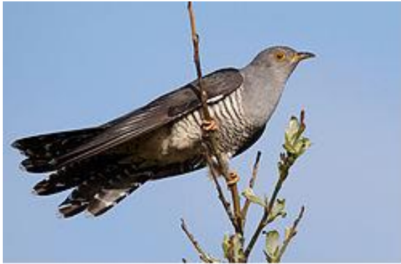
Fig 11. Cuckoo[12]

Termites: Macrotermes , figure 9 and figure 10, construct more complex nests with roughly cone-shaped outer walls with conspicuous ribs with ventilation ducts from the base up to its summit, brood chambers in the central of the nest which consists of the horizontal lamellae supported by pillars, a base plate with spiral cooling vents. A royal chamber is a thick walled protection bunker which is built within a few minute. There is a hole in the walls through which workers can pass. Fungus garden is draped around the hive and special galleries or combs lie between the inner hive and the outer walls for isolation. Pheripheral galleries surround both above and below ground which connect the mound to its foraging sites. One question arises that there should be someone in-charge who explains such sophisticated complex activities for the social insects. These complex insects can process sensory inputs, change their behavior according to the stimuli, and make decision without direct communication between inmates after processing large amount of information. The total complexities of social insects' colonies are more or more complex than the individual complexity of each insect. Therefore, it leads to a question: how does these cooperation and communication exist?