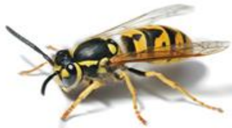
Fig 8. Wasp[8]