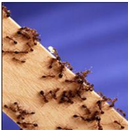
Fig 2. Fire Ant[3]