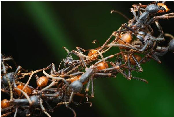
Fig 6. Eciton form bridge between a gap[6]