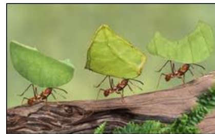
Fig 4. Leafcutter ants [4]