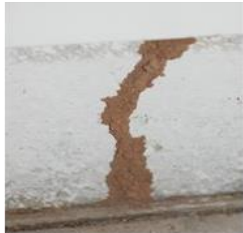
Fig 9. Termite[9]