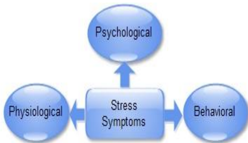
Figure 3. Stress Symptoms in Project Team

People experiencing stress undergo a lot of problems. The level of performance of stress takers decreases with time if they don't take precautionary measures before time. The many symptoms associated with above mentioned stress types [14] are grouped into three categories as shown in fig 3.