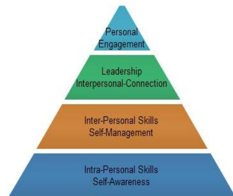
Figure 4. EI Skill Pyramid for Project Management

At organizational level leaders should develop intra-personal and inter-personal skills in his team. The EI skill pyramid needed for project management is shown in fig 4.