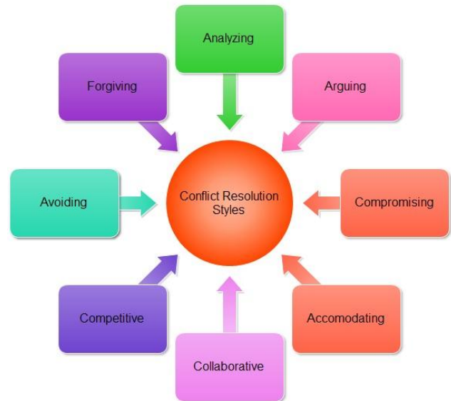
Figure 6. An 8-style approach for Conflict Resolution

We suggest an eight style approach for conflict resolution as shown in fig 6. Project manager with high EI uses these styles based upon the type of conflict occurred. A brief explanation of these styles is given below.