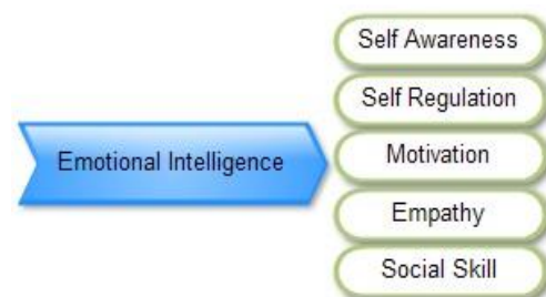
Figure1. Components of EI

achieving their personal and professional goals [2]. EI concept was more popularized by Daniel Goleman in his book “Emotional Intelligence” in 1995. Later on EI needs to be present in every field. EI has five major components. These components are shown in fig 1. The most necessary among these components is self-awareness [3].