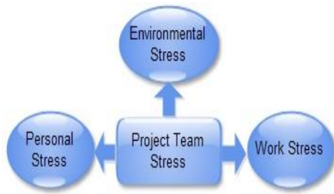
Figure 2. Types of Stress in Project Management

Types of stress [14] that project teams usually undergo are shown in fig 2. A brief explanation of stress types and symptoms associated with them is given below.