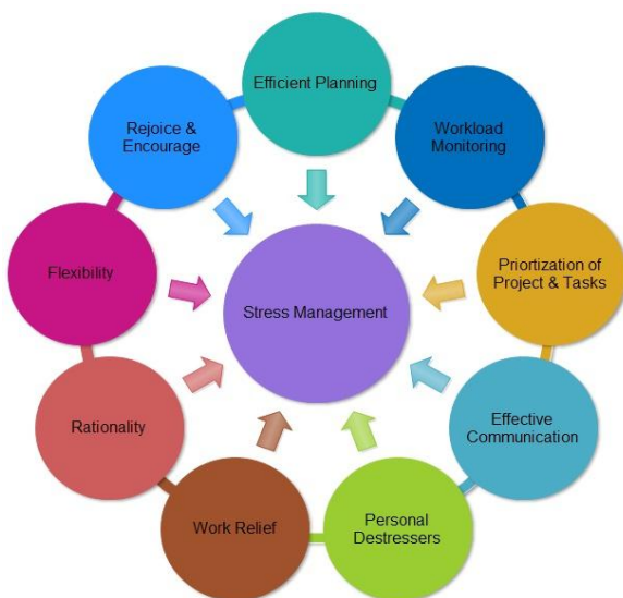
Figure 7. Nine Rules for Stress Management

With increase in stress awareness stress counselors focus on managing different types of stress associated with people belonging to different workgroups. Team leader should be a good counselor. We have suggested nine rules for managing stress in project team in connection with EI as shown in fig 7. These rules are described below.