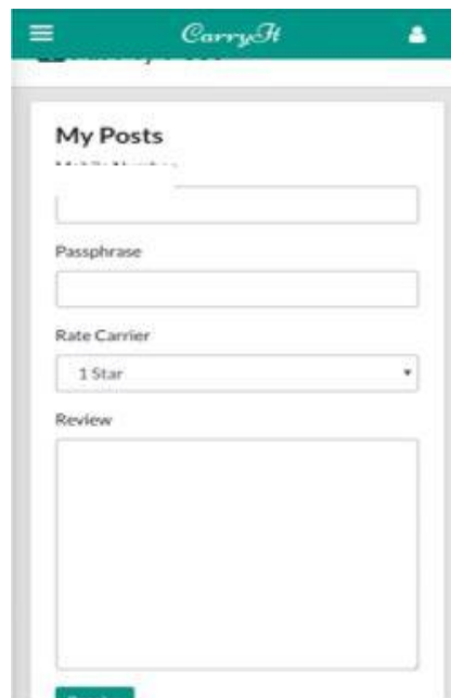
Fig. 7 Passphrase and rating interface for the receiver

Person X gets SMS on his mobile phone saying a request has been created against his post. If he finds it suitable, he accepts. Another SMS is sent to Person Y notifying that his request has been accepted. Then person Y hands over his parcel to person X. During the request process person Y needs to mention the receiver's name and mobile number. When the parcel is handed over the receiver will be notified of a passphrase via SMS. During the receiving process, the receiver is asked to provide the passphrase sent to his mobile phone followed by his mobile number. If the above information is correct then the parcel is registered as received. Person Y is being asked to provide a user review for person X for his service which is given in “Fig. 7”.