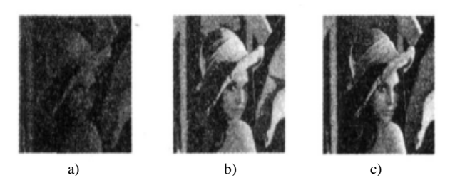
Fig 3. Results analysis. a) The original image; b) Traditional algorithm enhancement effect; c) The algorithm result of this paper

In Fig. 3, a) is the low light level original image.