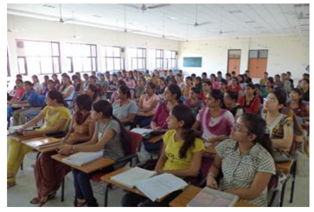
Fig.8. Snapshot of Seminar on Personality Development