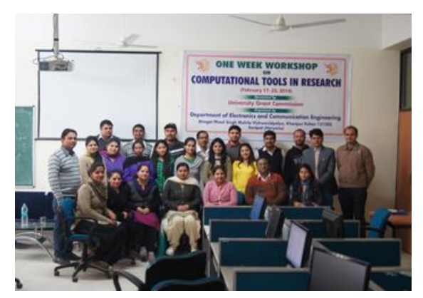
Fig.2. Photograph of workshop on Computational Tools in Research