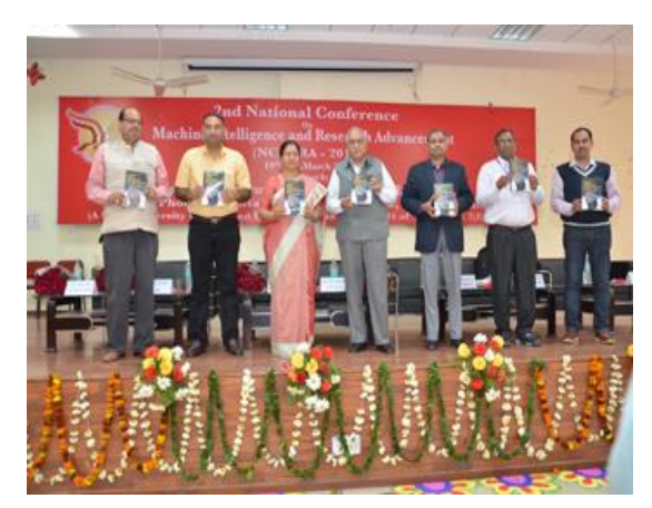
Fig.1. Snapshot of National Conference on "Machine Intelligence and Research Advancement"

A snapshot of National Conference on "Machine Intelligence and Research Advancement" and UGC sponsored workshop on Computational Tools in Research is depicted in Fig. 1 and 2 respectively.