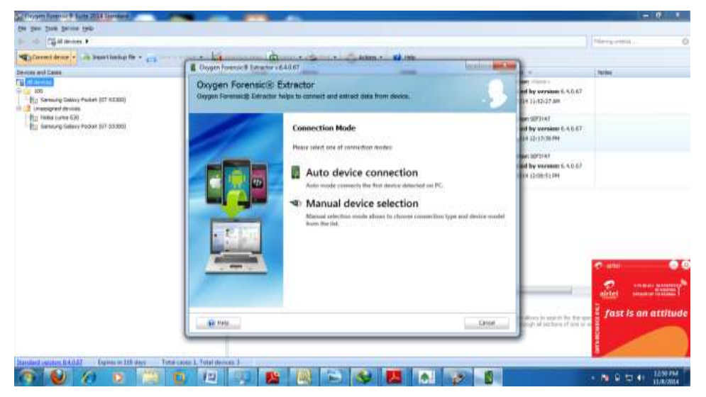
APPENDIX B: Connecting phone device to Oxygen Forensic