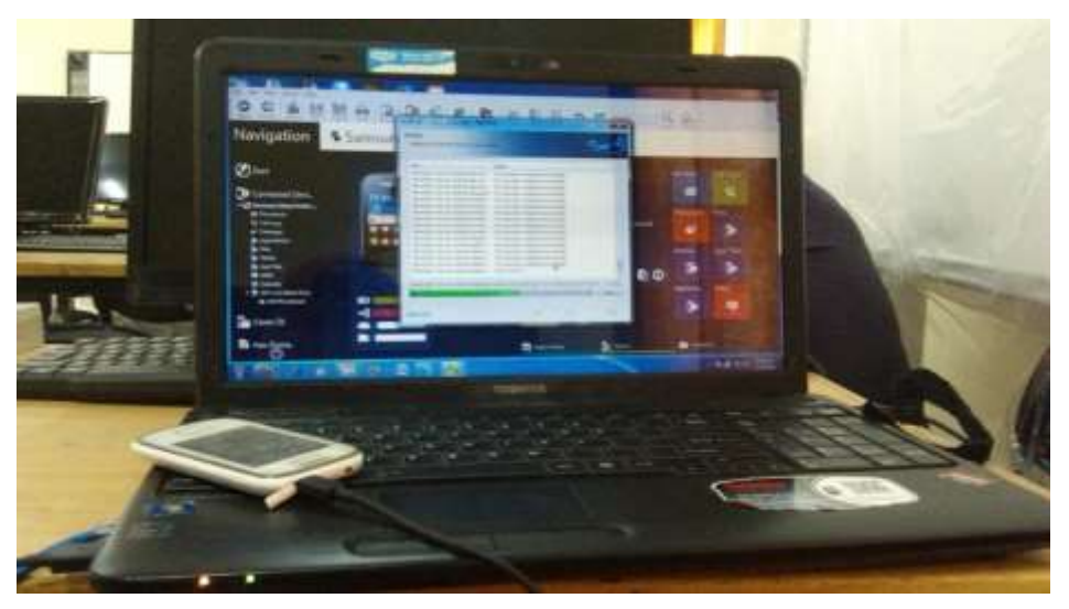
APPENDIX A: Extraction of mobile data

validate, or otherwise, results in our study. Further studies are also required to ascertain the specific versions and hardware MOBILedit would effectively perform on.