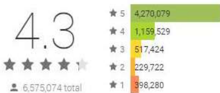
Fig.2. Ratings of Viber on Google Play Store.

Reviews are listed as per criteria selected based on following options as shown in fig.4.