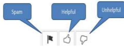
Fig.3. Detecting Spam and Helpfulness.

Fig.3 shows screenshot of options where user can give feedback about a certain review on app store that how he/she find out, whether review written by other user is helpful or not.