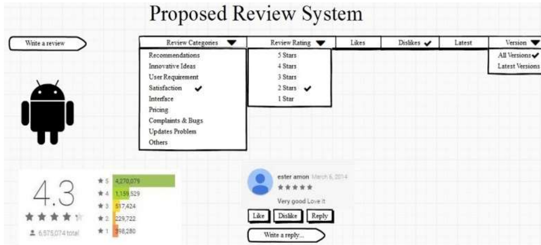
Fig.5. Recommendations of proposed review system

existing review system and suggested how the current review system can be improved to get quality app reviews. Depending on the limitation identified, we have proposed enhanced review system that can provision users to provide more informative reviews and get better decision making regarding an app. Fig.5 provide an overview of the proposed review system and brief description is as follows.