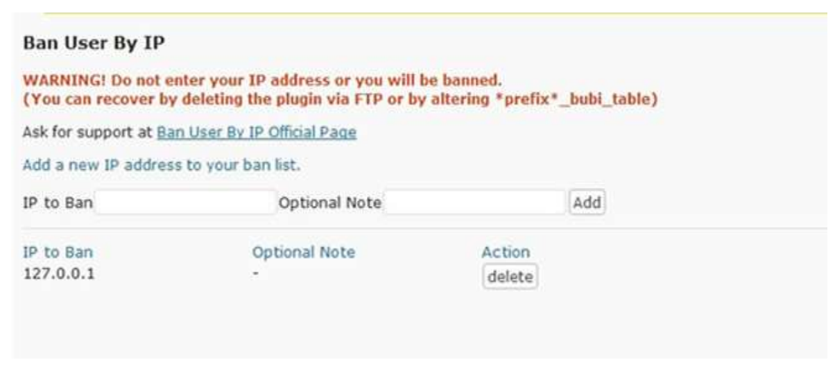
Fig. 3: Testing IP address banned by the Content Filter