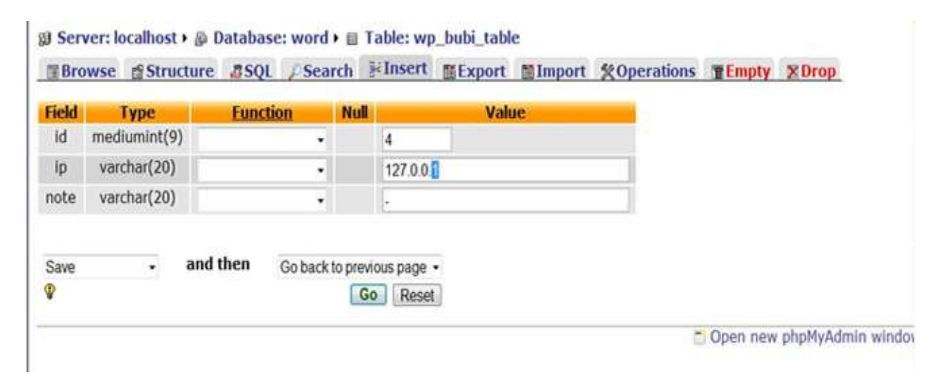
Fig. 4: IP address is been removed by the Content Filter from the Database

Content filters software was developed to ban user from access illegal contents or fraudulent websites. This approach enables the administrator to have access to the client server and any illegal site viewed can be deleted. Since internet viewing by the citizen can now be controlled.