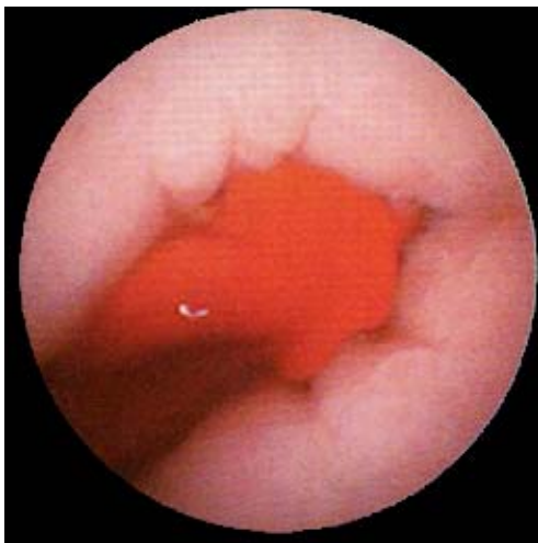
Figure. 1. Image of the gastrointestinal tract in the wireless capsule endoscopy.

Capsule endoscopy has provided clinicians with the non-invasive ability to detect abnormal changes of the gastrointestinal tract (generally in small bowel) often missed by other techniques. [1], [2].