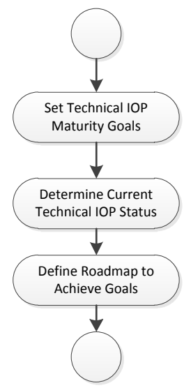
Figure 3: ISIMM application

interoperability layer (i.e., D, S, C and P).