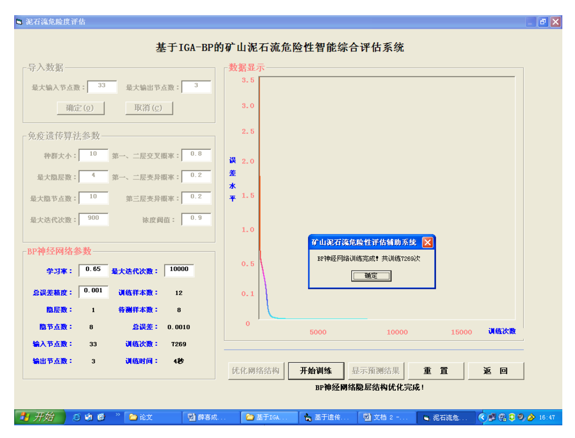
Fig. 3. Main interface of software system

The results of immunity genetic algorithm show that for the certain training sample data and number of input and output neurons, the optimal hidden layer structure is as follows: the hidden layer is 1 and the number of hidden layer neurons is 8. It can be confirmed that the type of the optimize structure of BP neural network is 33-8-3. The immunity genetic algorithm and artificial neural network mathematical model were combined together. The immunity genetic algorithm was used to optimize the hidden layer structure and network parameters of BP neural network. Then 7269 trains were made on BP neural network using "sample models" of mine debris flow with given dangerous degree, and the network intelligence evaluation of the mine debris flow risk were realized in the end(Fig. 3).