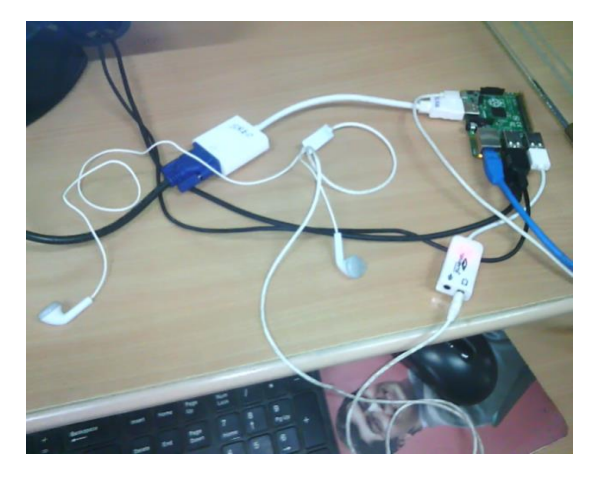
Fig.5. Experimental Setup of the System

connected with the audio adapter which is connected with the speaker and mike.