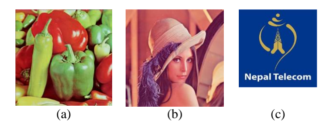
Fig.1. Standard Test and Watermark Image (a) Pepper (b) Lena (c) Watermark